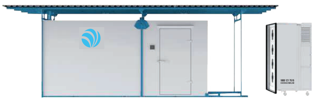
(Ecofrost Link detached view from the cold room)

Inverter Technology based refrigeration system that works efficiently, even during hours of low sunlight.